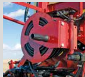
External Cleaning Kit