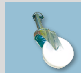
Maneuvering wheel kit